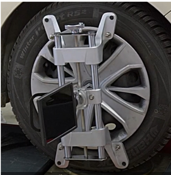
10"-21" Self-centering wheel clamps with 26" extender brackets

Operating Light Indications in integrated synoptic panel.