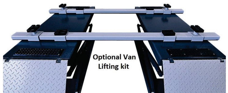
Optional Van Lifting kit