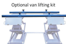
Optional van lifting kit