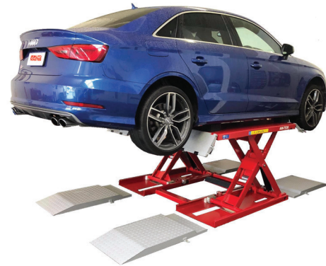
Shown with optional low car ramp extension kit